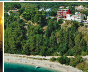
Palatino (red building) is directly above Valtos beach