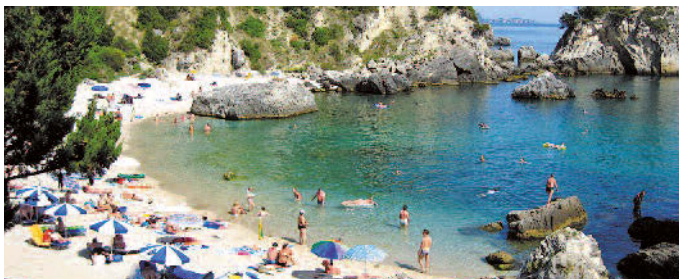
Piso Krioneri beach

The Hotel: 2 Stars Bed & Breakfast Air Conditioning Free WiFi