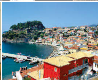
Acrothea is the red buildings